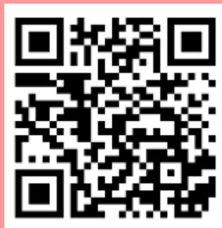
Sunday's Digital Bulletin